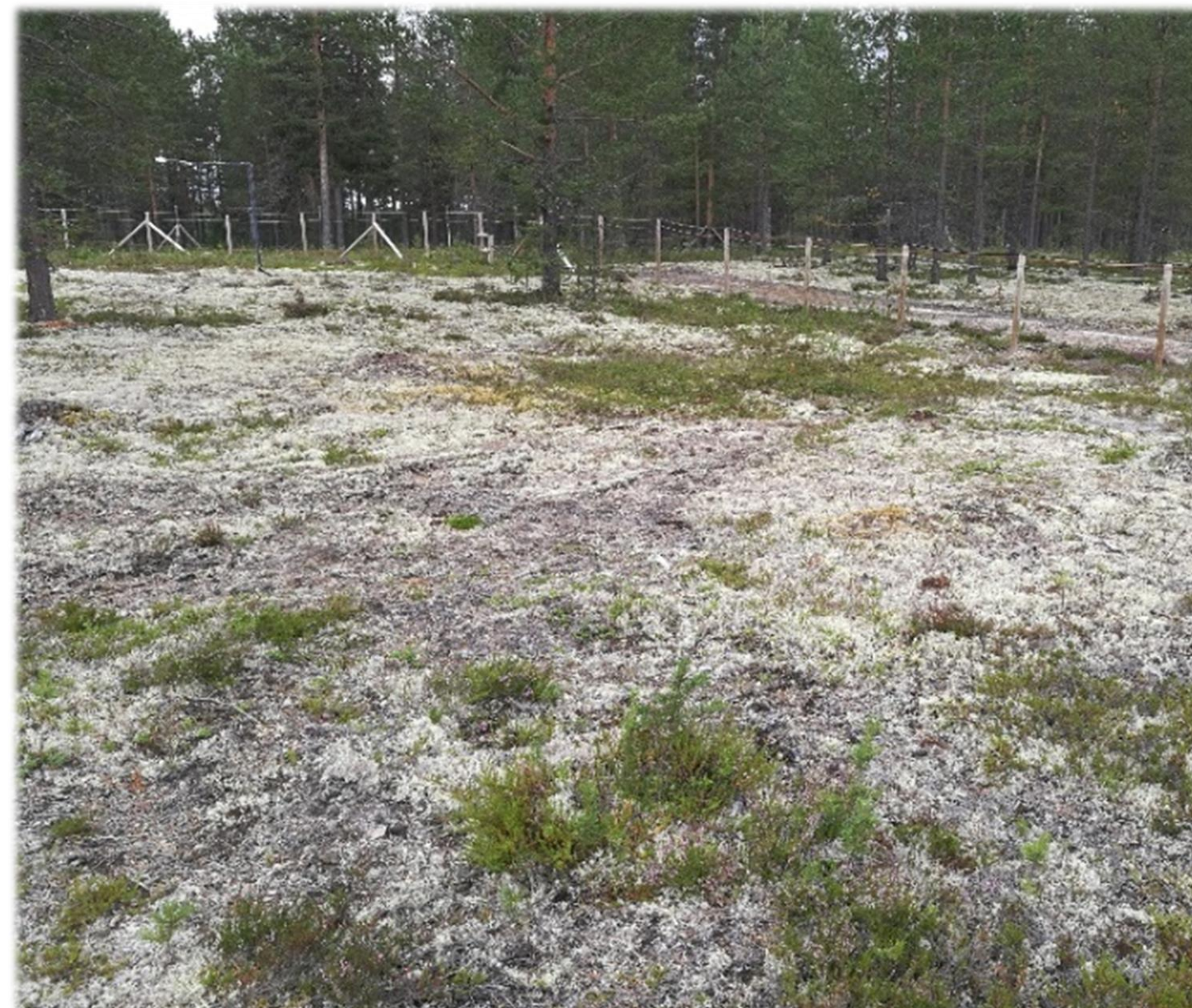
Above: Measurement site locates in Sodankylä, northern Finland. Snow pit measurement site is in clearing of sparse pine forest.