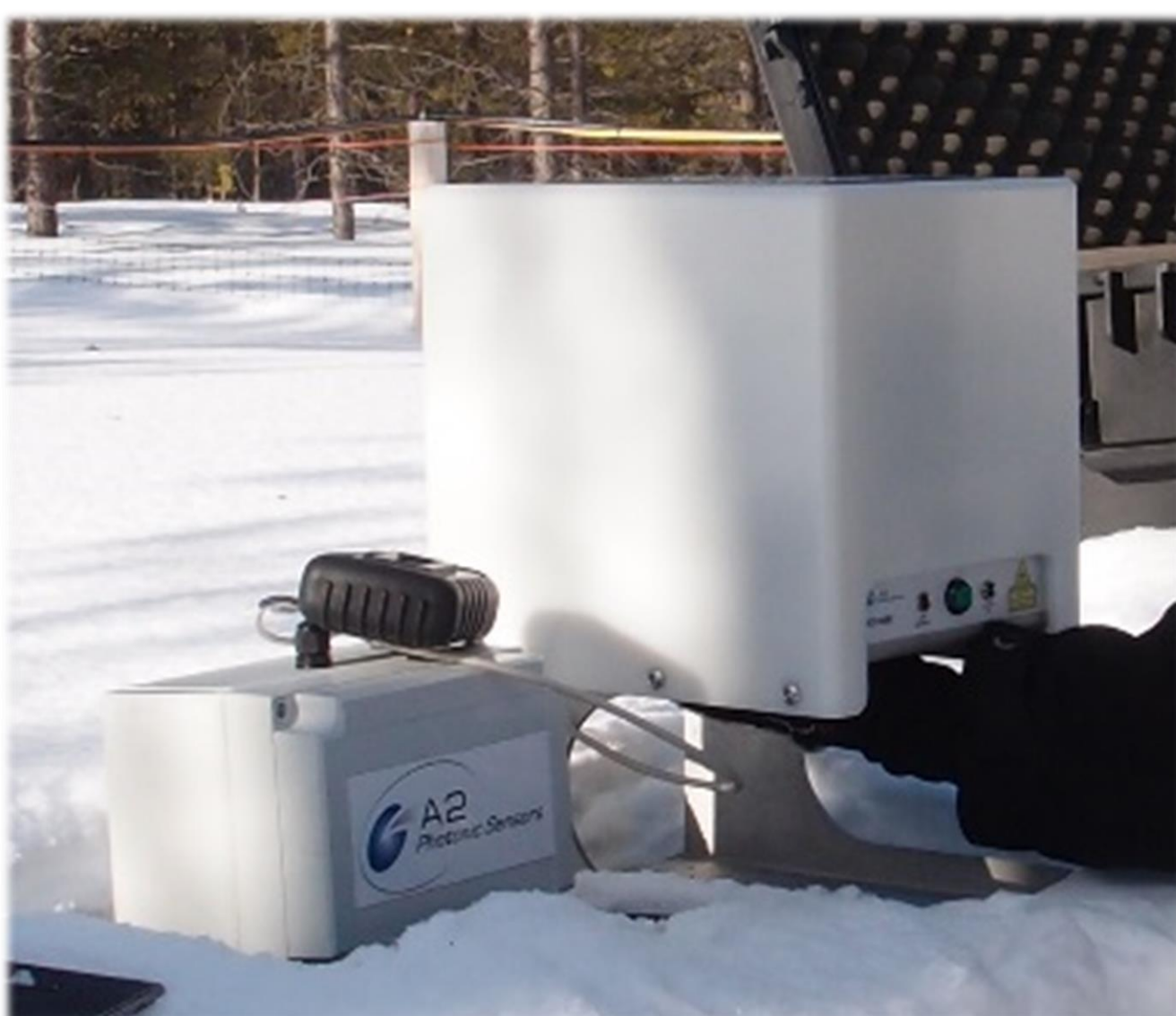
Below: IceCube (left) and QualitySpec Trek (right)